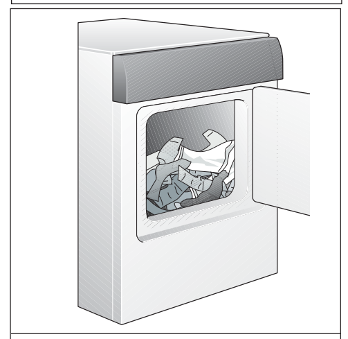
Fill dryer drum 1/3 to 1/2 full.