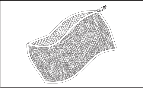
Place small items in a mesh bag.