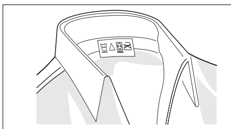
Follow fabric care label instructions.