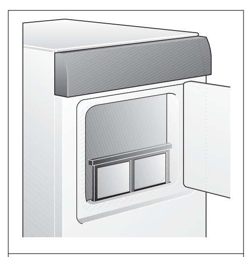
Clean lint screen after every load.

A WARNING To reduce risk of fire or serious injury to persons or property, comply with the basic warnings listed in Important Safety Instructions and those listed below.