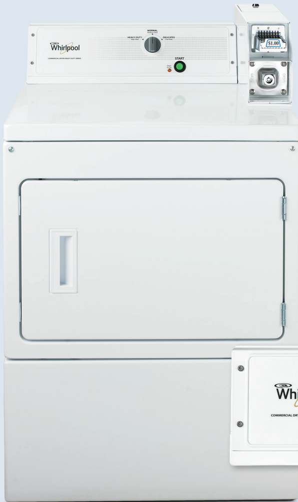
Coin slide and coin vault not included.