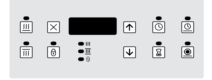
Figure 1 Figure 2