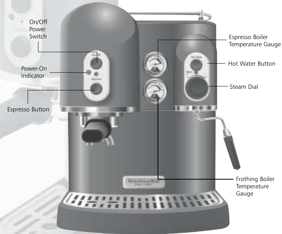
Model KPES100 Espresso Machine