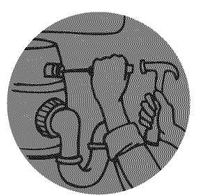
If there is a disposal, remove the disposal plug.